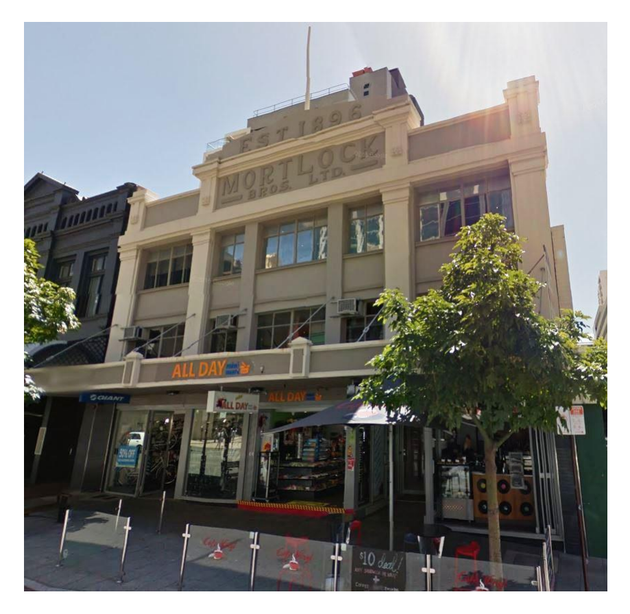
Mortlock Bros Ltd 1016 Hay Street Perth of 1933